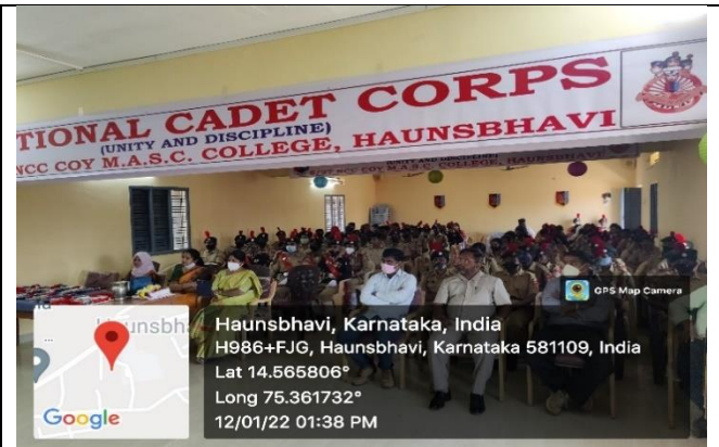
Student and Staff